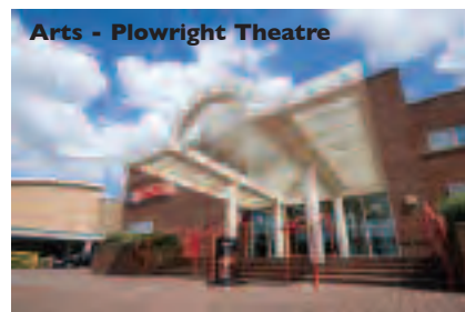
Arts - Plowright Theatre

We provide advice on building design, contract supervision, quantity surveying and building maintenance to council departments. Call 01724 296754