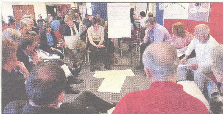
HAVE YOUR SAY: Members of the public at the council-run forum.

The break out groups were led by the 'party leaders', and this provided an opportunity for all members to discuss the 'cross-party' issues. After a thorough