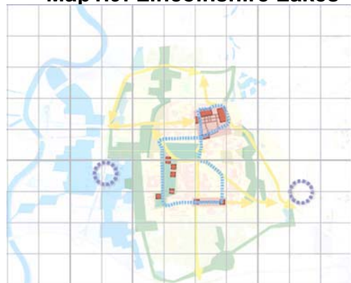
Map1.9: Lincolnshire Lakes

A feasibility study for the development of this project has been commissioned. This would be a major transformational project and there are far reaching transport implications that are discussed in chapter x