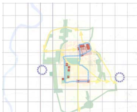
Map 1.8: New century garden

This element of urban renaissance has yet to be developed but is likely to include early consideration of improvements to the A18/Doncaster Road route from the M181 to the town centre which is the main route into Scunthorpe from the West and includes areas of localised congestion at Berkeley circle