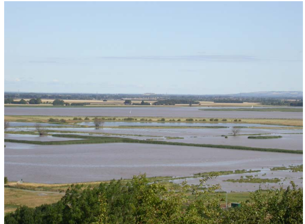
View of Alkborough Flats

The North Lincolnshire Local Access Forum was established by North Lincolnshire Council in response to sections 94 and 95 of the Countryside Rights of Way Act 2000 and had its first meeting in December 2003. It works as an advisory body on the improvement of public access to land for open-air recreation and enjoyment, having regard to the needs of land management and the desirability of conserving the natural beauty of the area.