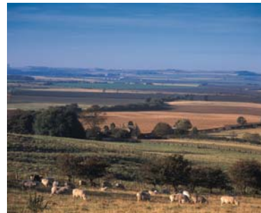
View from the Wolds