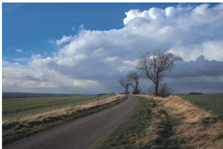
Middlegate, near Worlaby